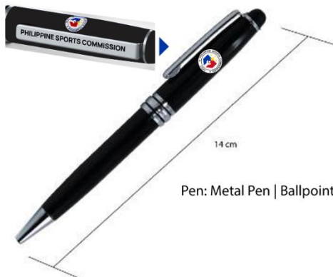
Pen: Metal Pen | Ballpoint | Twist Pen