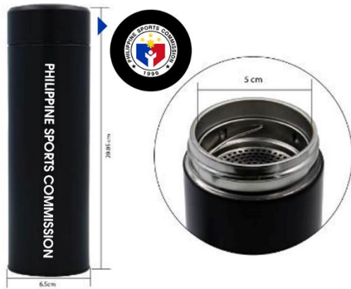
Tumbler: Stainless Tumbler | 500ml