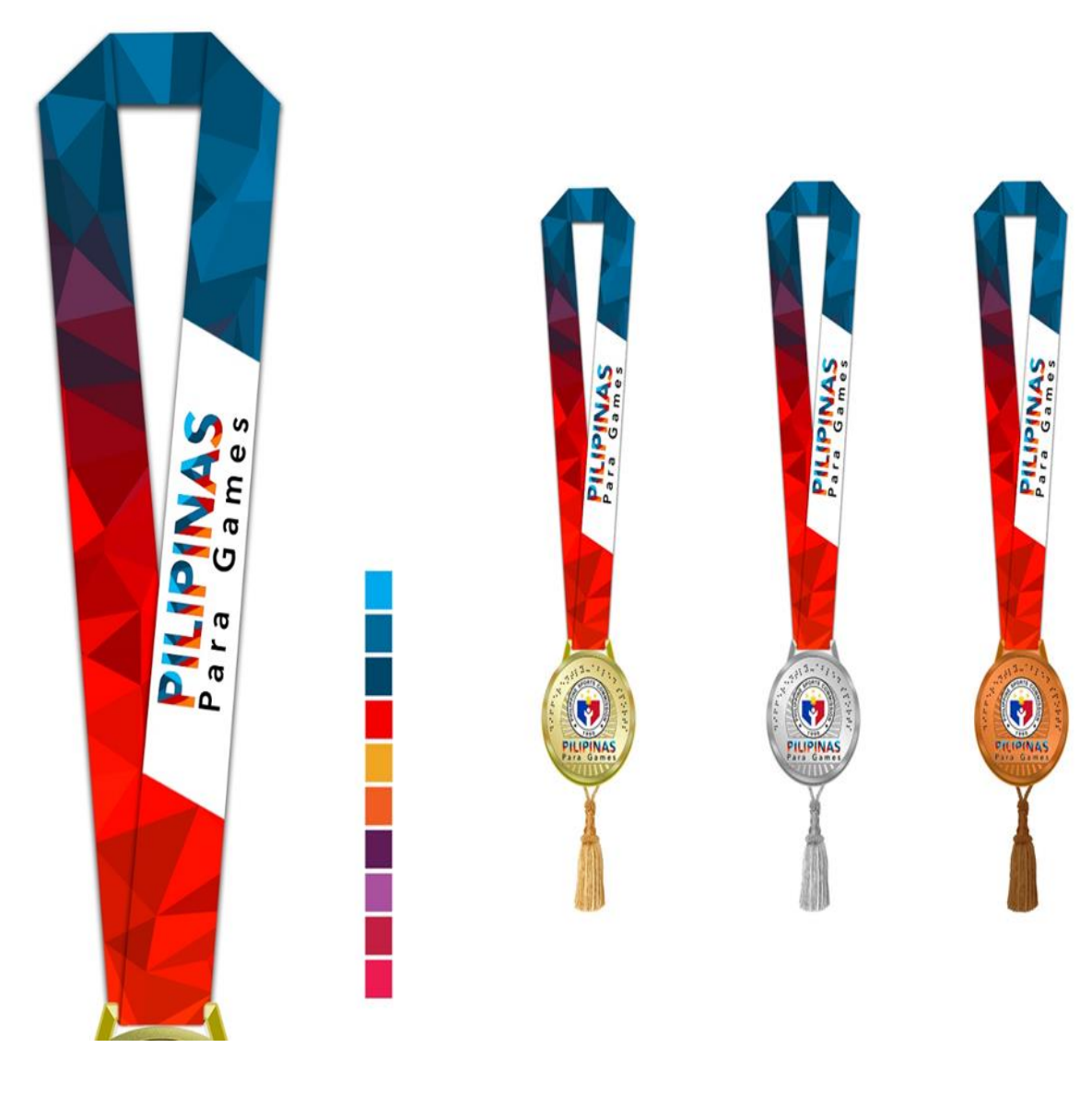
LACE DESIGN WITH TUSSLE